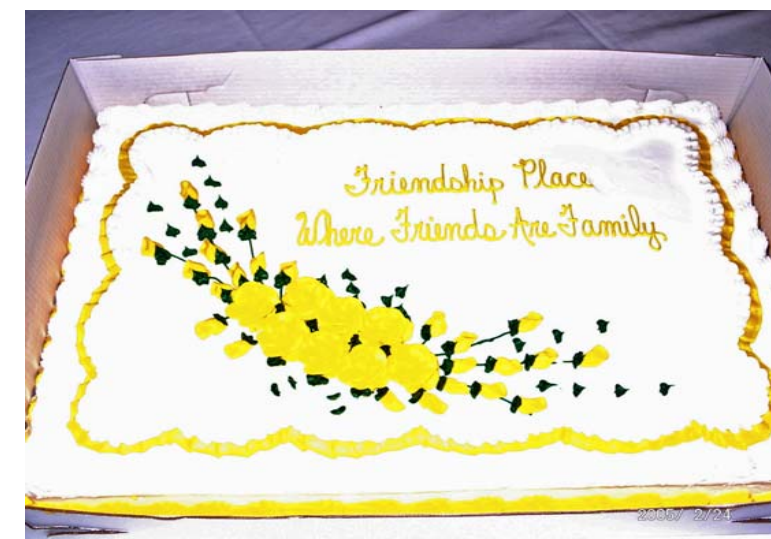
Banquet cake from Cops Bakery.

Banquet Guests enjoying the Family Style Meal.