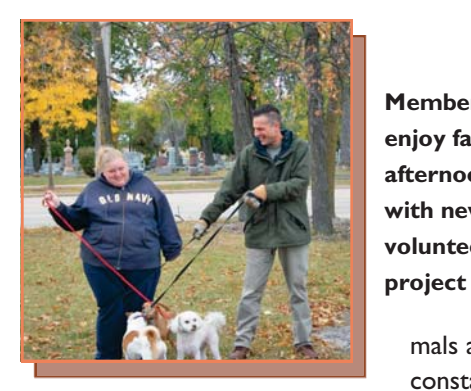
We are all aware of the power animals can bring to our

ered it a big success, and have stated to staff that they feel a calmness come over them when they are around the dogs.