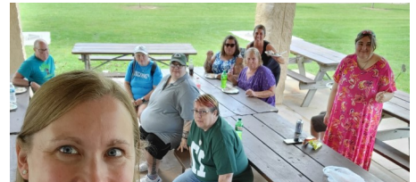
Pudgy Pies @ O'Hausser Park