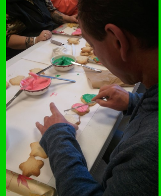
Bake Holiday Cookies