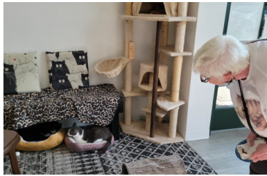
Pawffee Shop Cat Café Outing