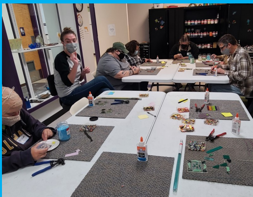
Art Class at Berg- strom-Mahler Museum of Glass