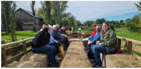
The Little Farmer